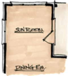
OPTIONAL SUN ROOM 170 sq. ft