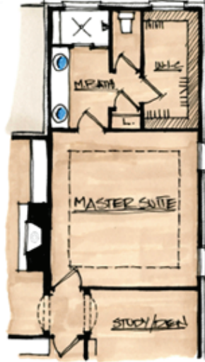
OPTIONAL MASTER SUITE