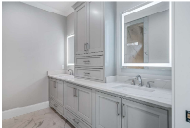
Optional features may be shown