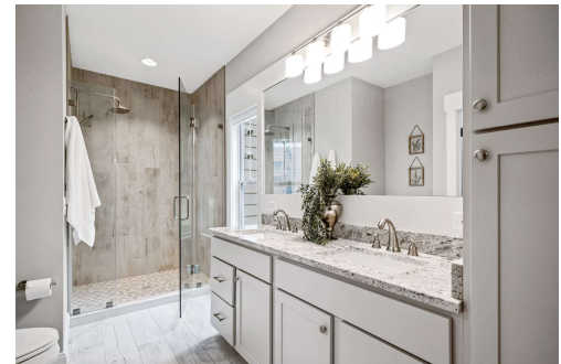
Optional frameless glass shown