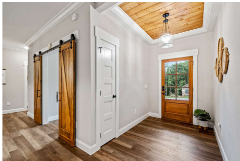
Upgraded barn doors shown

Comprehensive preselected exterior and interior designs make it easy to have peace of mind that your home design is current and timeless.