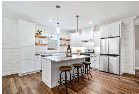
Upgraded hood shown