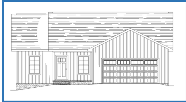
The Logan 1372 SQ FT 3BD/2BA