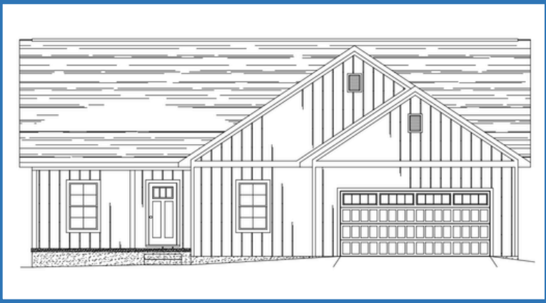
The Brimley 1612 SQ FT 3BD/2BA