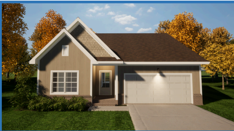
The Ashford 1474SQ FT 3BD/2BA