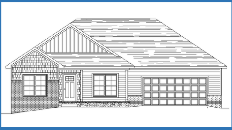
The Wakefield 1794 SQ FT 3BD/2BA