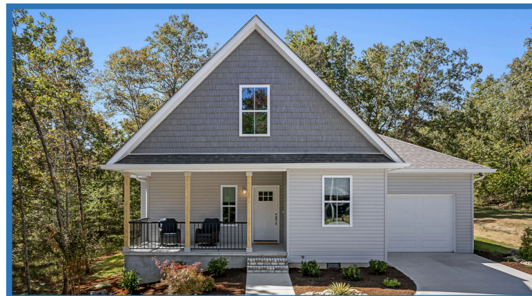
The Bungalow 1450 SQ FT 3BD/2.5 BA